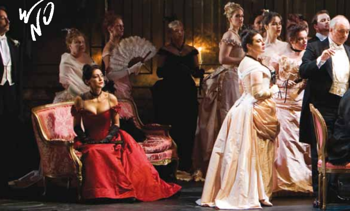
La traviata (2009 cast pictured)