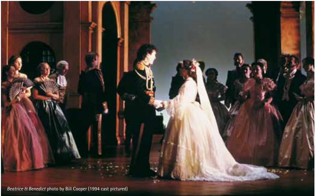
Beatrice & Benedict (1994 cast pictured)