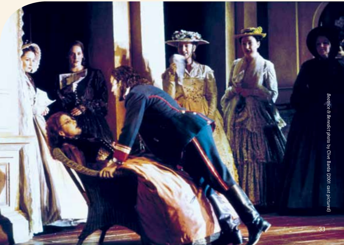
Beatrice & Benedict (2001 cast pictured)