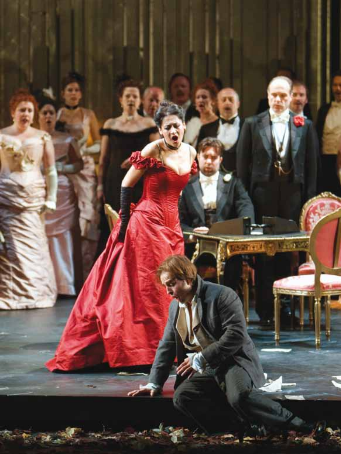
La traviata (2009 cast pictured)