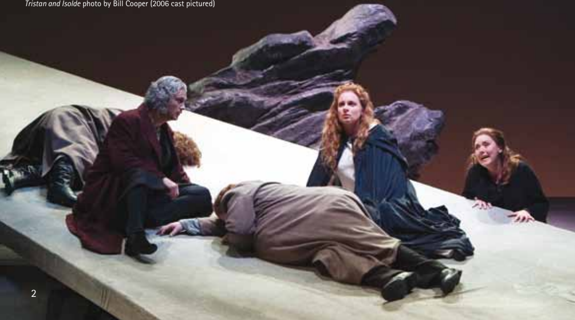
Tristan and Isolde (2006 cast pictured)