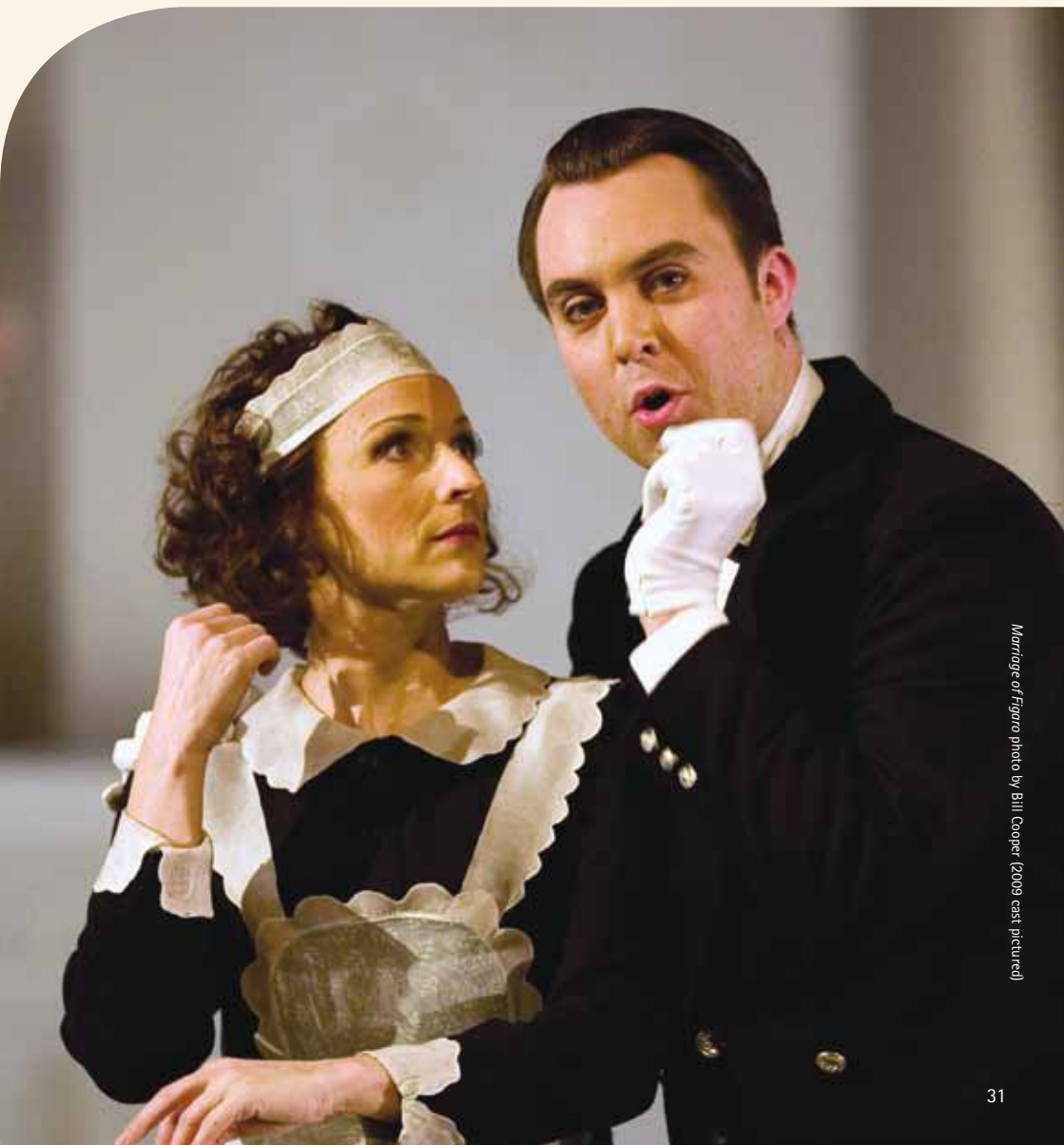
Marriage of Figaro (2009 east pictured)

All WNO Extra events except Audio Description take place at Wesley Memorial Hall on New Inn Hall Street.