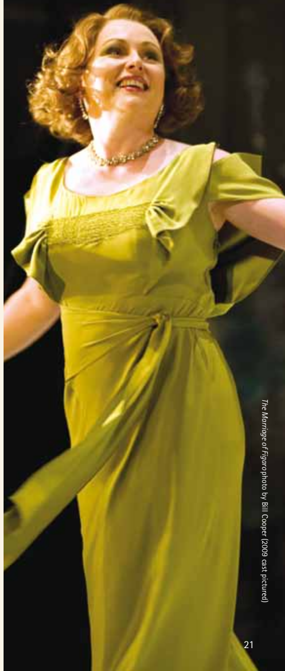
The Marriage of Figaro (2009 cast picture)

£7.50 – £39.50 Great performances at great prices