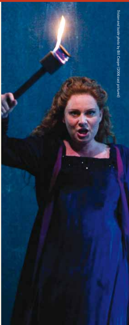
Tristan and Isolde (2006 cast picture)

You can book for ticketed WNO Extra events by phone, online or in person.